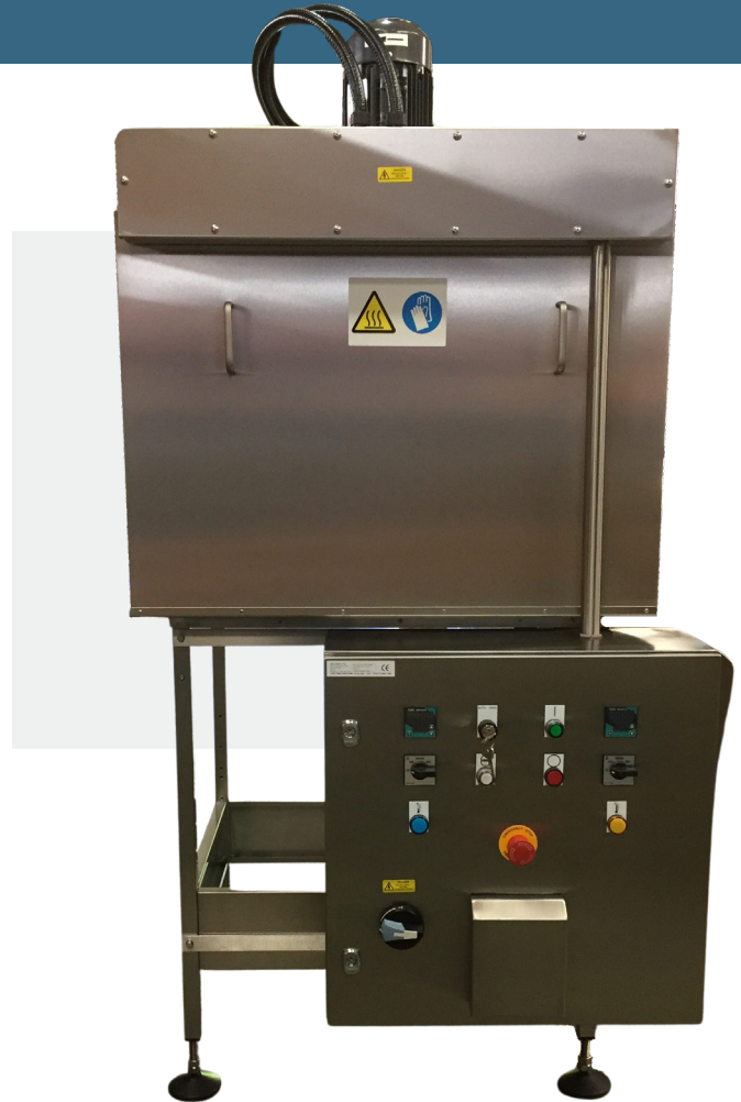
Product supplied may differ from image based on container drying requirements.