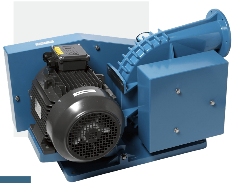
Product supplied may differ from image based on pressure requirements. Image represents Model 587 High Velocity Blower.