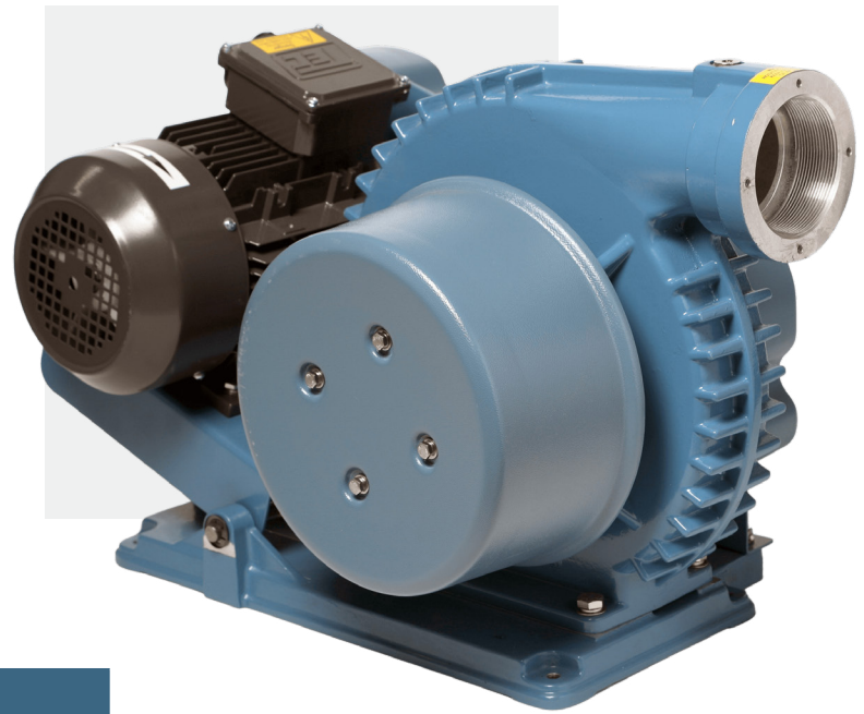
Product supplied may differ from image based on pressure requirements. Image represents Model 580 High Velocity Blower.